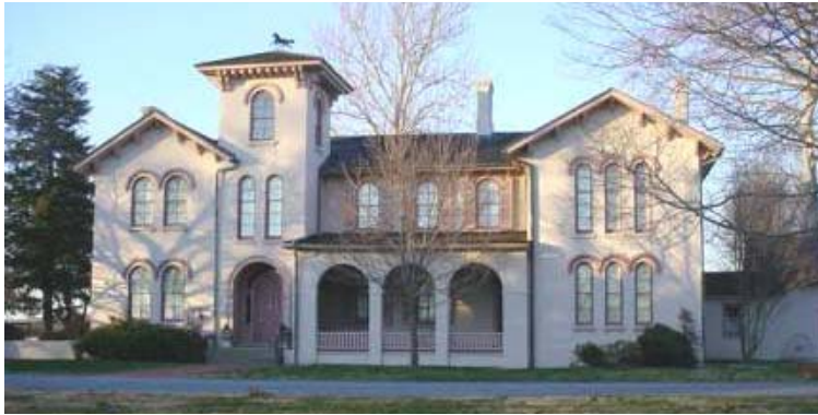
This lovely Italianate style mansion is located on 20 acres north of Seaford, DE.

Cost: $2.00 per student and chaperone; teachers are free