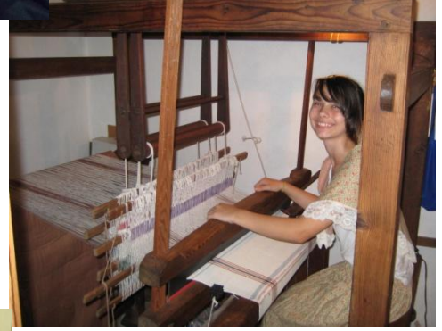
Weave on a loom