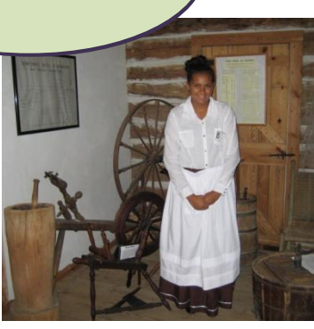
Serve as a docent in the Ross Mansion or an outbuilding