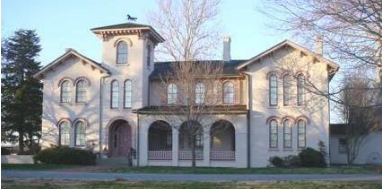
Tour this lovely Italianate style mansion located on 20 acres north of Seaford, DE.

Tour the only documented log Slave Quarter in DE